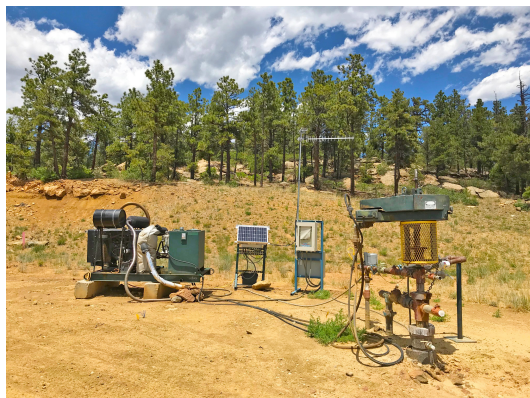
Interconnected devices monitor the status of the site, and cnReach EP radios transmit data.