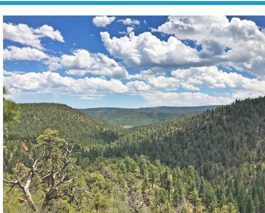
A fully connected natural gas field. The cnReach wireless network works in dense foliage.